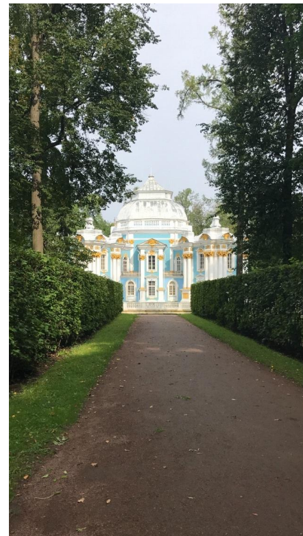
Image: Catherine Palace gardens, St Petersburg