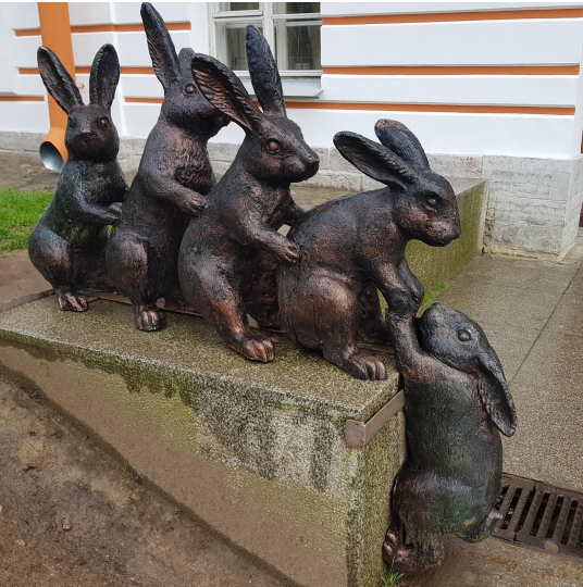
Image: Statue at bunny island - Peter and Paul Fortress, St Petersburg