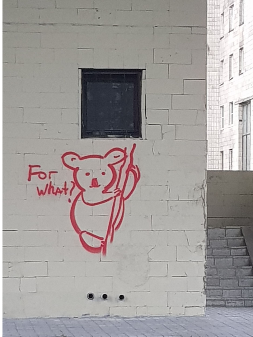
Image: Photo of Koala graffiti on apartment block, St Petersburg