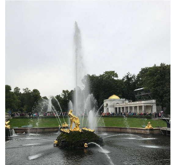
Image: Fountain, Peterhof, St Petersburg