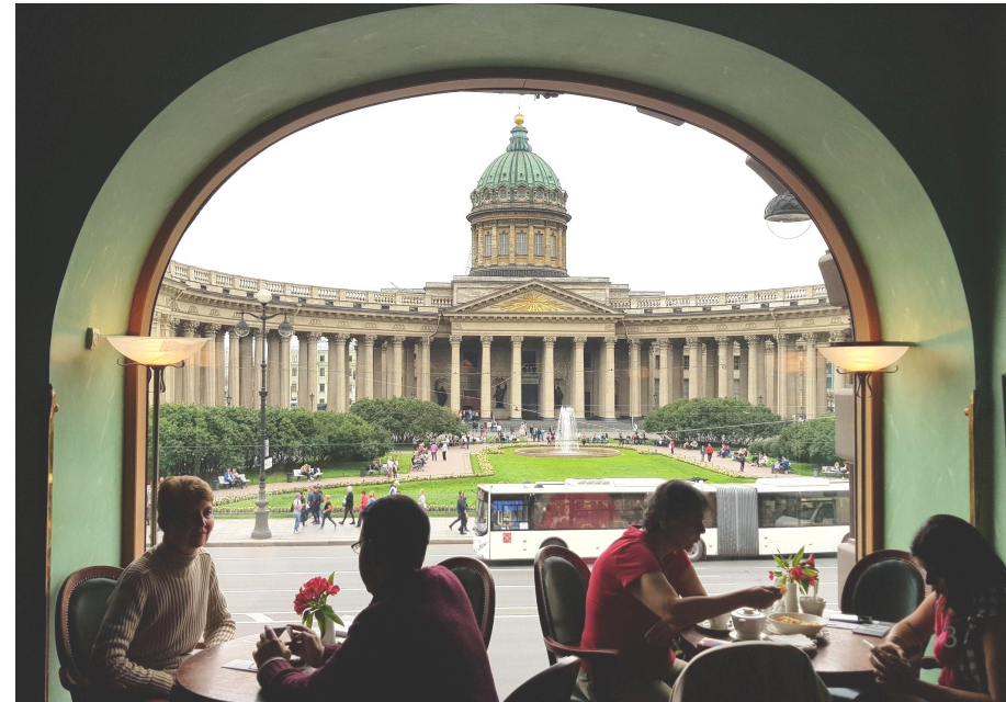
Image: View of Kazan Cathedral from Cafe Singer, St Petersburg