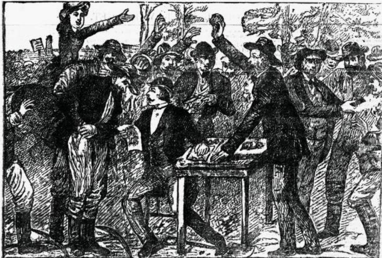
REPORTED DISCOVERY OF A NEW GOLD FIELD IN GIPPSLAND.